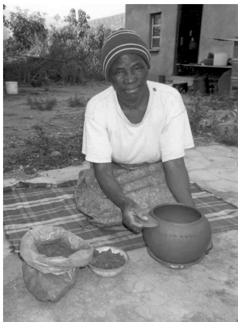
The final product: In India the men are the potters, working exclusively on the wheel, with women sometimes assisting in decoration and finishing work. In South Africa women manage the entire production process. The potters wheel is absent in rural African ceramic production.

However, since the notion is embedded in resistance against both a white racial attitude and the subjugation of black races by imperialist invasions, it encompasses a wide range of relationships. At a personal level, the “other” is defined by skin colour and at a global level it expresses the divide between Africa and western countries (Fanon, 1986). Thus when the focus of the discourse is on the attitudes of a micro-ethnic group, the boundaries are narrow and they exclude all other communities, including the so-called “brown” races. Conversely, if the spotlight shifts to resistance against imperialist power structures the contours of the “other” gets blurred and encompasses all those who were subjugated. In summery, the object under scrutiny, the objectivity of the investigation and the positioning of the observer are all factors that impact on the study on culture.